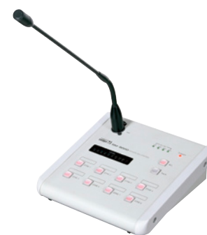
RM8000 Mic Station

The four connections are prioritised (from one to four) and, in certain circumstances, a lower number will override other stations. Individual volume controls are on the back of the PX8000 and an output control is on the remote console along with a volume knob for the speaker (monitor) in the base of the microphones. One interesting omission: there is no facility on the PX8000 to 'lock out' any of the remote mics. So potentially, the annual board meeting in one zone might be interrupted by the receptionist singing