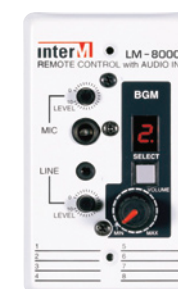
LM8000 Remote Control