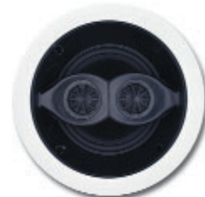
Extreme XSSTR In-Ceiling Speaker