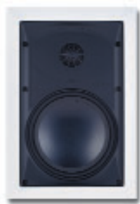
Extreme XT In-Wall Speaker