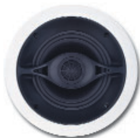
Extreme XTR In-Ceiling Speaker